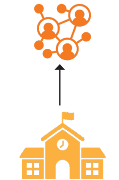
School-based Telehealth Program