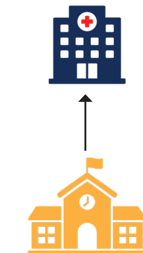
School-based Telehealth Program