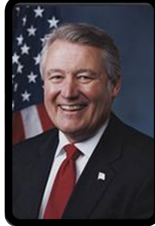
Rep. Rick Allen (R) 12th District 202-225-2823 Email Rep. Allen