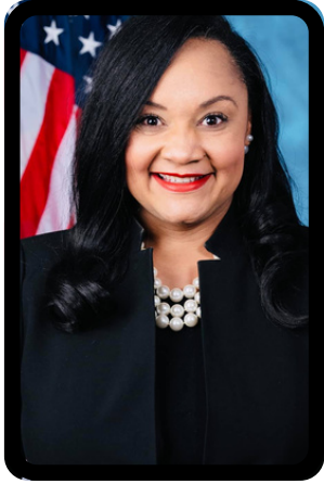
Rep. Nikema Williams (D) 5th District 202-225-3801 Email Rep. Williams