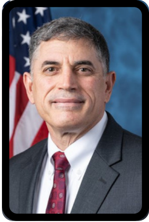
Rep. Andrew Clyde (R) 9th District 202-225-9893 Email Rep. Clyde