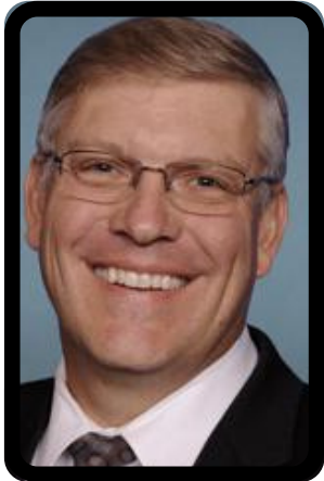
Rep. Barry Loudermilk (R) 11th District 202-225-2931 Email Rep. Loudermilk