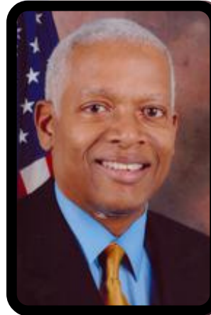
Rep. Henry "Hank" Johnson, Jr. (D) 4th District 202-225-1605 Email Rep. Johnson