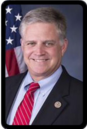
Rep. Drew Ferguson IV (R) 3rd District 202-225-5901 Email Rep. Ferguson