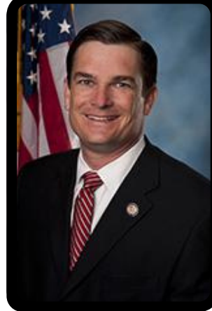
Rep. Austin Scott (R) 8th District 202-225-6531 Email Rep. Scott