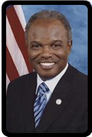
Rep. David Scott (D) 13th District 202-225-2939 Email Rep. Scott