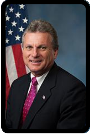
Rep. Buddy Carter (R) 1st District 202-225-5831 Email Rep. Carter