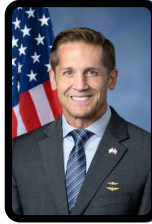
Rep. Rich McCormick 7th District 202-225-4272 Email Rep. McCormick