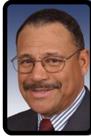
Rep. Sanford Bishop, Jr. (D) 2nd District 202-225-3631 Email Rep. Bishop