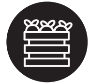
Fruit and Vegetable Boxes