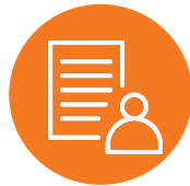
Curriculum Where Kids Touch and Taste Food