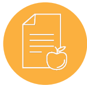
Meal Planning Services