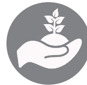
Gardening with Kids