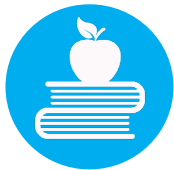
Nutritional Education for Parents